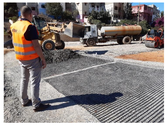
Installation damage campaign on site supervised by AFITEXINOV