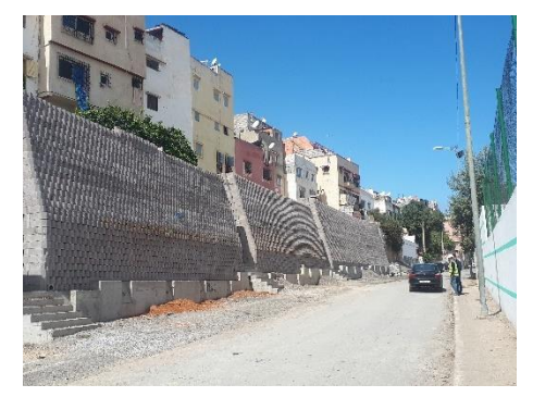
Latest pictures of the project